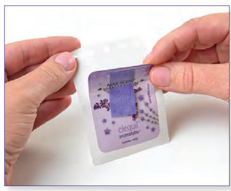
3. Lift the self-adhesive aromatabs® off the paper backing.

Using your thumb, press down and hold the self-adhesive aromatherapy tab in place on the paper backing. With your other hand, pull and tear the clear cellophane pouch AWAY FROM you at the preferred NOTCH to expose the scented tab.