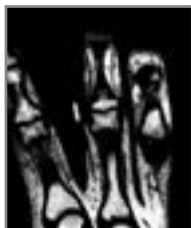
Ortho-SPOTS Packets #186