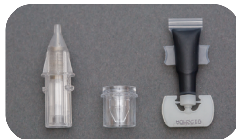
Safety Needle, Ink Cup, Pigment

Comfort Marker 2.0 System, Qty 1 MPCM2010INT Patient Marking Set. Includes: Safety Needle (Qty 50), Ink Cup (Qty 50), Black RadSafe Pigment (Qty 50) MPCM4022INT